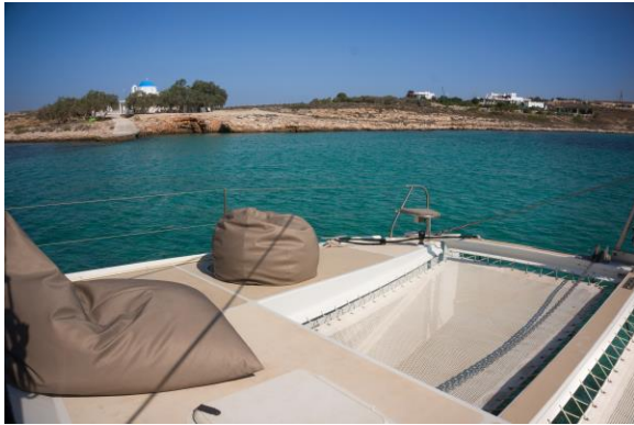
Front deck relaxing area