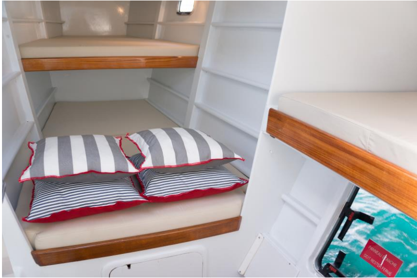
Three bunks cabin